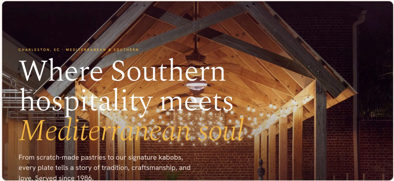
Hero: full-bleed atmosphere, a confident serif headline, the gold accent, and a single clear action.

A working prototype of the anchor page, built with Saffron's real photography and copy. It sets the visual system the rest of the site follows.